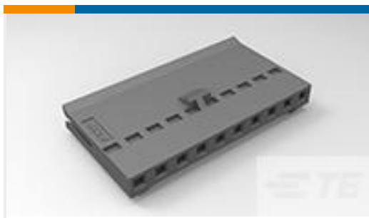
TE Part # 1-487769-0 012 HOUSING FFC RCPT 100CL SR